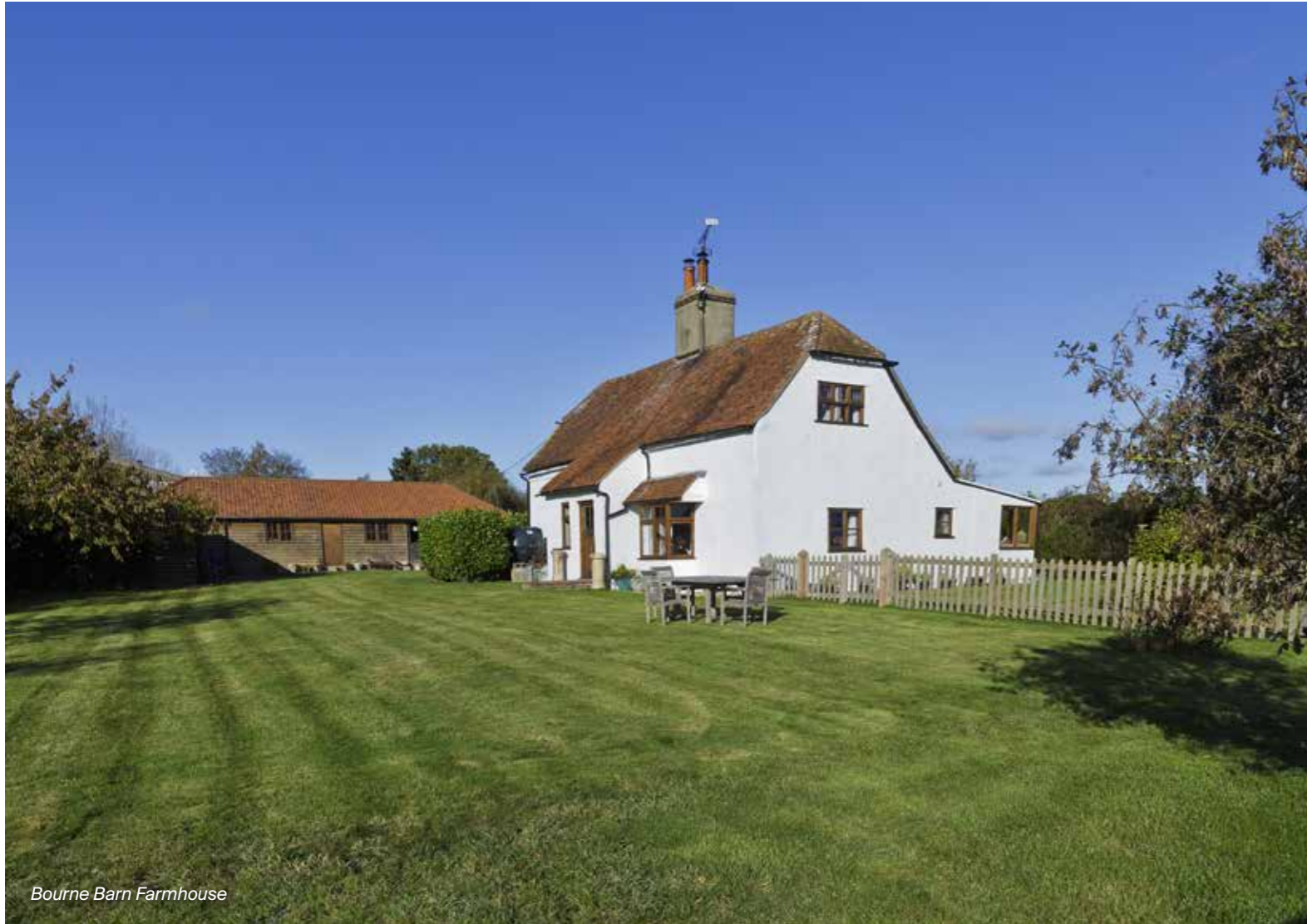
Bourne Barn Farmhouse

Lot 1 extends to 97.42 acres of pasture and temporary grass on the banks of the River Colne.