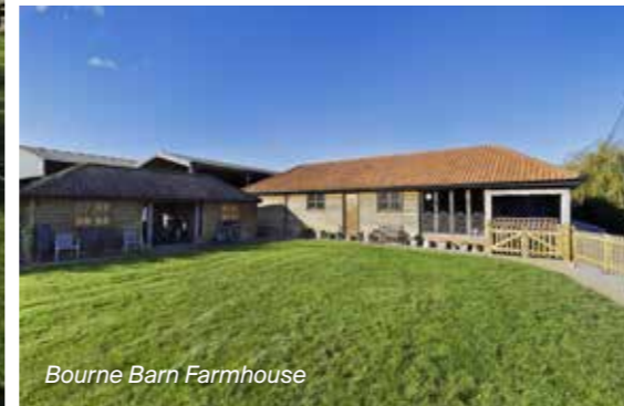
Bourne Barn Farmhouse