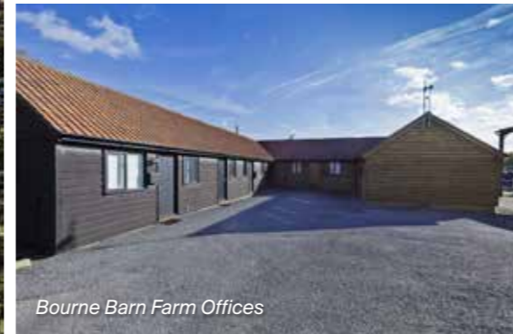
Bourne Barn Farm Offices